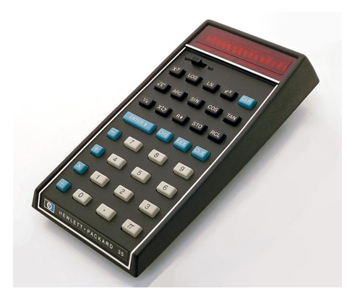
Fig. 1. HP-35 introduced in 1972 was the first world's scientific calculator. It used the postfix notation. Attribution: Hweihe [CC BY-SA 3.0 (http://creativecommons.org/licenses/by-sa/3.0/)]

The description "Polish" refers to the nationality of logician Jan Łukasiewicz [1]. He is the Polish notation inventor (1924), while the reverse Polish notation was introduced much later – in 1954 by Arthur Burks, et al. [2]. This approach was extensively employed by Edsger W. Dijkstra in stack oriented computers.