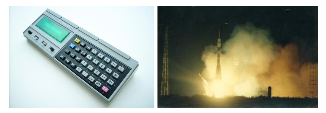
Fig. 4. Elektronika MK-52. The first Soviet programmable postfix calculator used in space flown on the "Soyuz TM-7" mission.