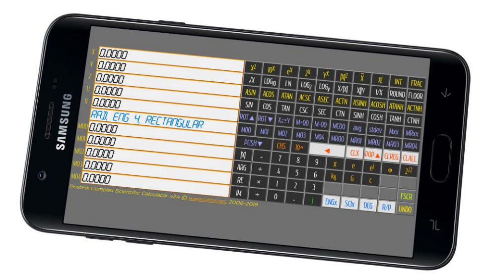
Fig. 5. The postfix complex scientific calculator application opened on a smartphone. Hosted at http://ialms.net/calcp/ with free access.

During the last 13 years the author was constantly developing and improving a software application. This is a complex postfix scientific calculator meant for space scientists and engineers, but also helpful to any scientist in need for a pocket calculator with RPN notation working with complex numbers. The software is free. It is also platform independent and requires no download nor installation steps. These features place it ahead of any existing mobile device app that does require download and installation, and in the general case is not platform independent.