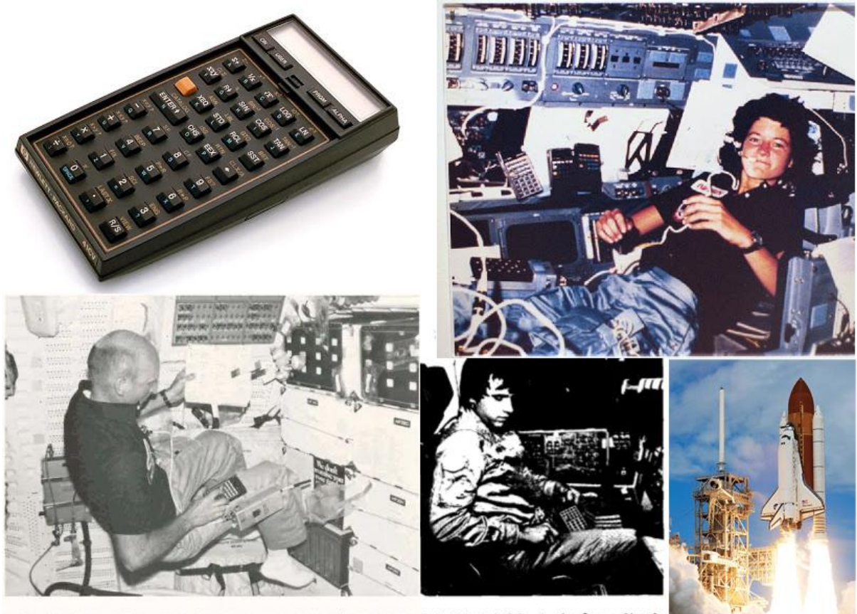
Astronaut Gordon Fullerton aboard Columbia on the last flight, using his HP-41. Notice that he is "aitting" in midair, in the "zero" gravity of outer space.

Project. It was a backup in case of failure of the Apollo Guidance Computer. Later other HP calculators flew in space among which the most famous and most widely used is the HP-41C (see Fig. 3). It was the major pocket calculator on the Space Shuttle programme [5]. During the early 80-ies, the times when the Space Shuttle's first flight took place in 1981, computer technology had advanced rapidly and was already highly miniaturized. NASA purchased the HP-41C programmable pocket calculator and loaded it with a variety of software for use by the Space Shuttle crew. Only a few minor changes were administered like adding Velcro strips to the case and removing some parts that might emit gases during flight.