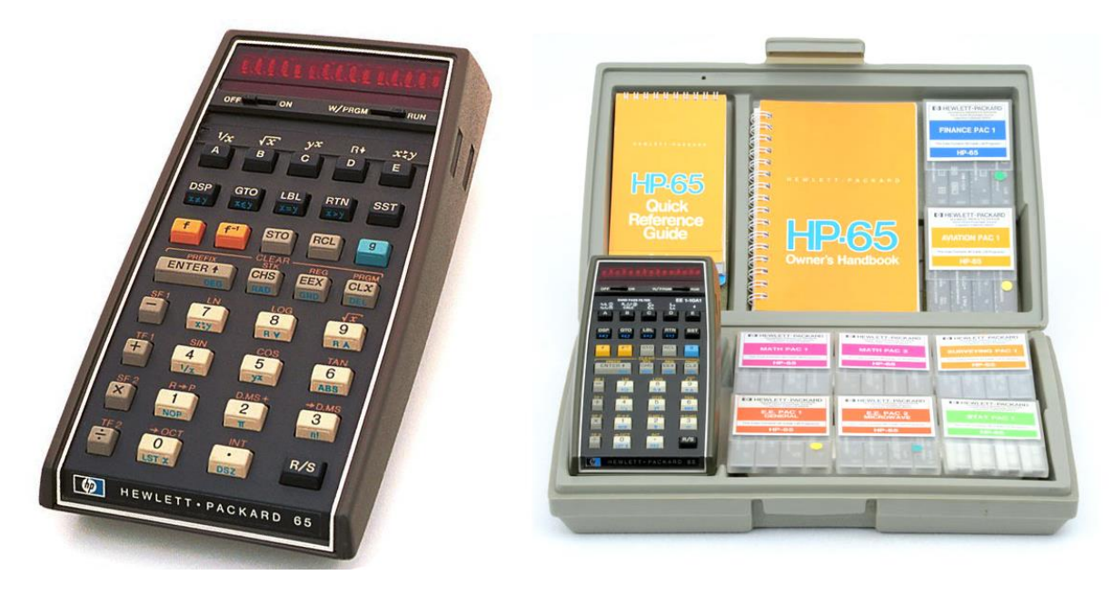
Fig. 2. HP-65 - the first programmable handheld calculator in space used in the 1975 Apollo-Soyuz Test Project

The description "Polish" refers to the nationality of logician Jan Łukasiewicz [1]. He is the Polish notation inventor (1924), while the reverse Polish notation was introduced much later – in 1954 by Arthur Burks, et al. [2]. This approach was extensively employed by Edsger W. Dijkstra in stack oriented computers.